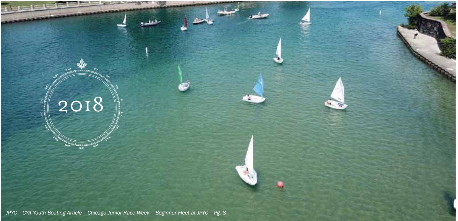
JPYC – CYA Youth Boating Article – Chicago Junior Race Week – Beginner Fleet at JPYC – Pg. 8