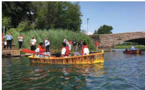
JPYC, SSYC and Chicago Maritime Arts Center partner on youth boat building class

Sailing Association, the Brotherhood for the Fallen and the 100 Club of Chicago , hosted the 2nd annual Gold Star Regatta , a fundraising regatta to benefit fallen Chicago police officers and first responders. Among the highlights of the Gold Star Regatta was the Chicago Police Fire Department's boat shooting its water cannons off at the start of the race! JPYC's race committee also hosted the 2nd annual Chicago Junior Race Week's Green Fleet . 17 boats were on the line at JPYC for the Beginner Race fleet – of which 10 boats were JPYC youth – and, for the first time ever, JPYC sent four 420 teams to the 420 and one of our teams (including an Open Horizons student who had only been sailing two weeks) took 2nd place in the 420 fleet! Last but not least, JPYC hosted the inaugural Jimmy Webb Memorial Regatta and we were thrilled to see so many T-10s come out to celebrate Jimmy's life and legacy by racing in this event. JPYC's Mise En Place crew were also featured on WTTW's Chicago Tonight Show as a group of predominately African American and women sailors racing in