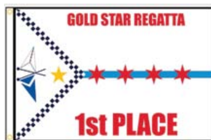
Brag flags for the Gold Star Regatta, the crossed flags of the CPSA's and JPYC's burgees are the Gold Star Regatta's logo