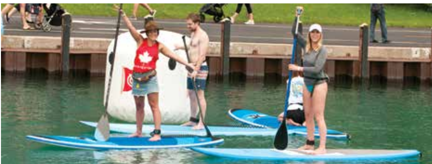
Paddle boarders at the starting line