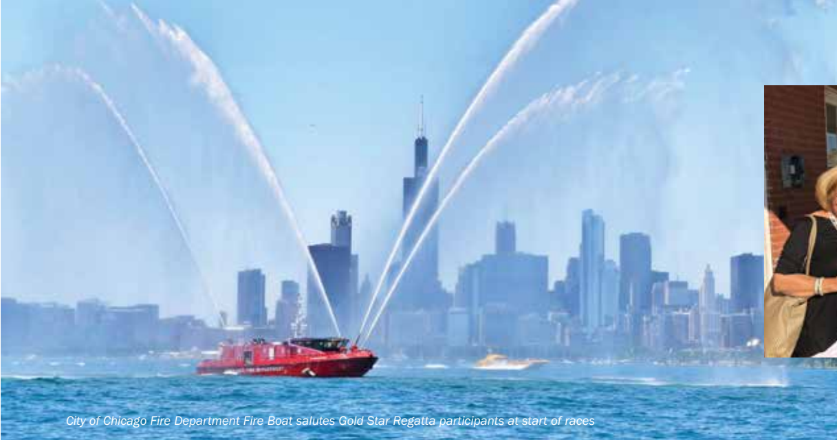
City of Chicago Fire Department Fire Boat salutes Gold Star Regatta participants at start of races