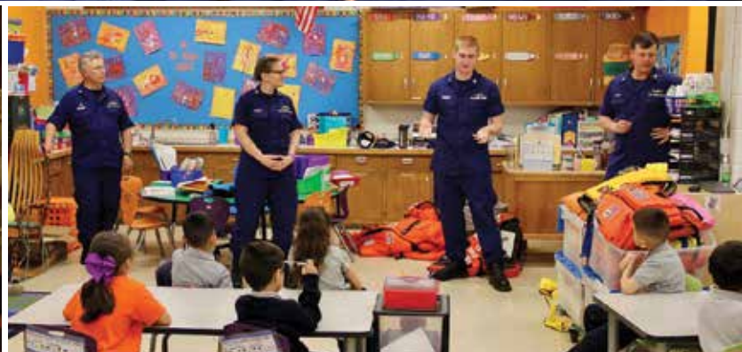
Coast Guard Auxiliary and Active members speaking about water safety.