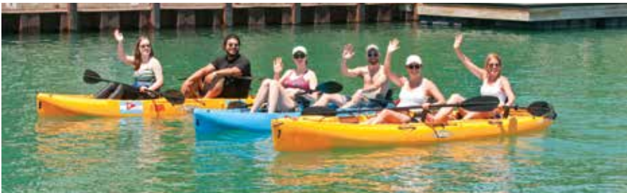
Kayak racing was added to the competition this year