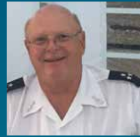
Chuck Goes Editor & Staff Photographer