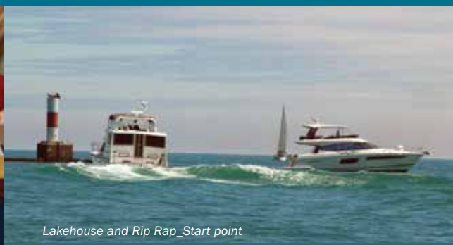
Lakehouse and Rip Rap_Start point