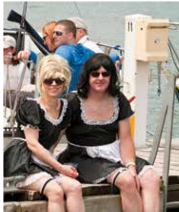
Costumes are encouraged at Dock Dash!