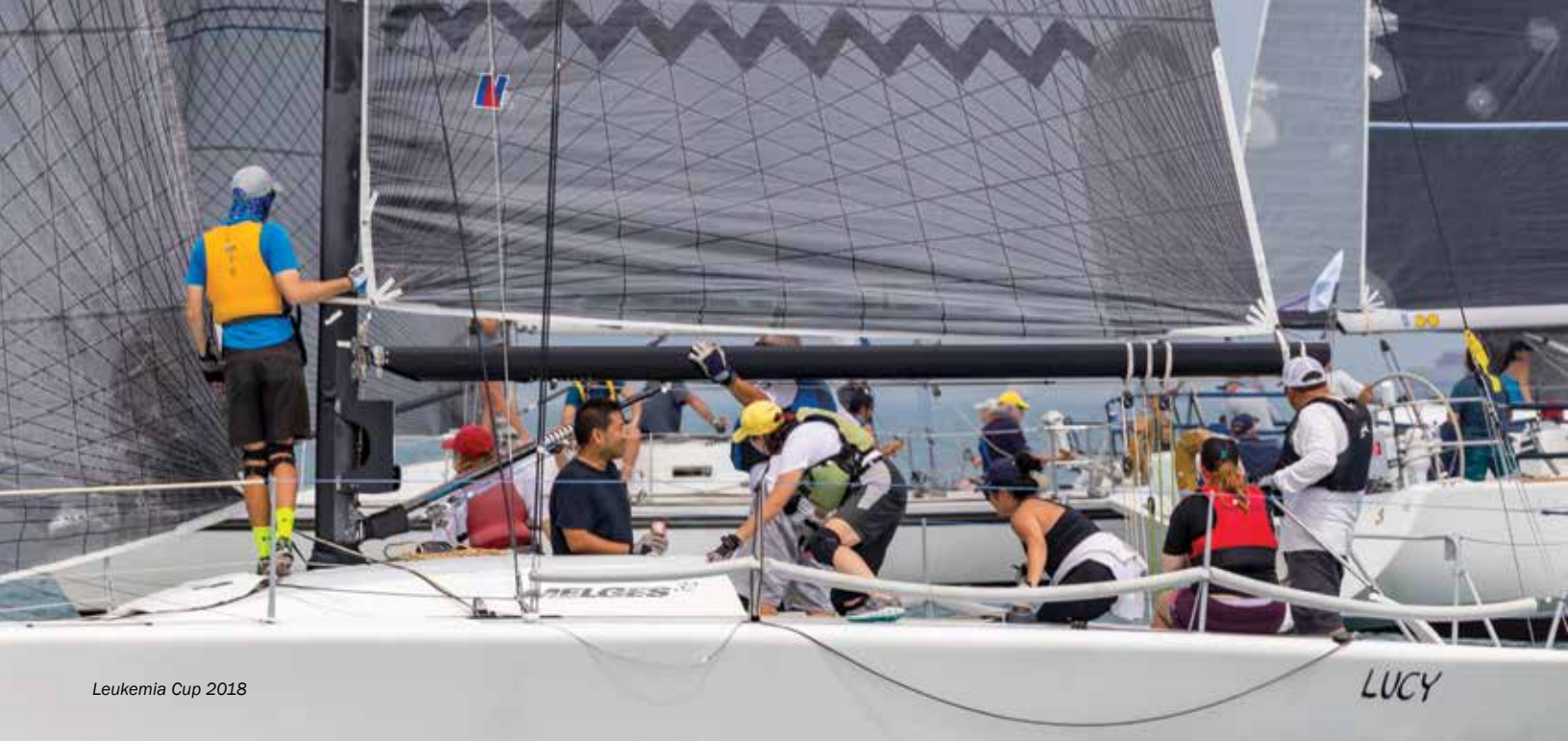
Leukemia Cup 2018