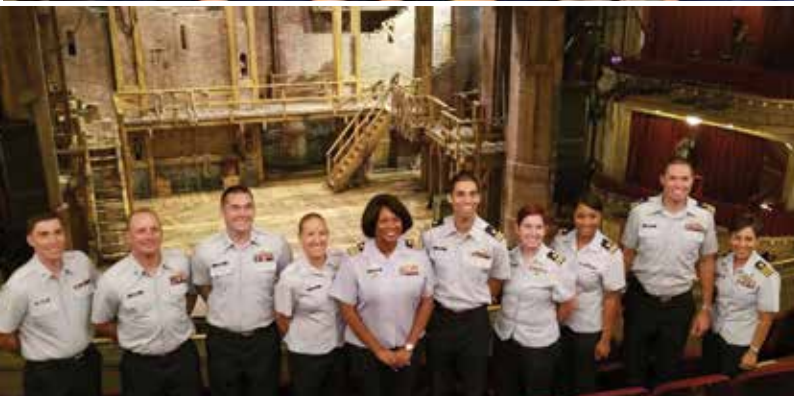
Celebrating Coast Guard Day at Hamilton, the Coast Guard's founding father.