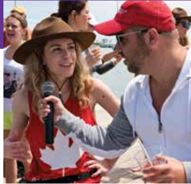
Color commentary added to the festivities