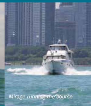
Mirage running the course