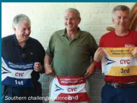
Southern challenge winners

Next year the National Championship will return to Chicago on August 3rd, 2019. Come out and join in the festivities.