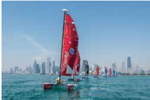
Youth Boating in Chicago, Pgs. 8-10