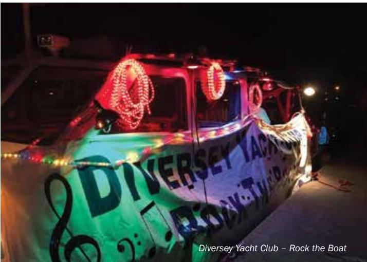
Diversey Yacht Club - Rock the Boat