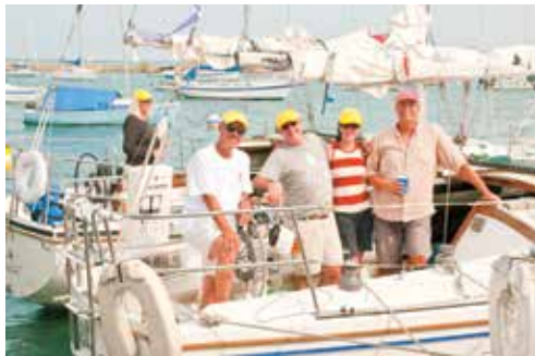
Leukemia Cup, Pg. 19