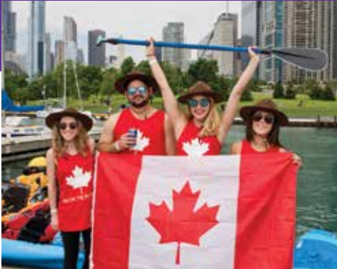
Determined Dock Dash participants