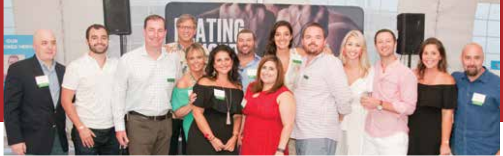
The Cooler By The Lake organizing committee

The "8th Annual Leukemia Cup Poker Run & Cooler by the Lake" event was held at the Columbia Yacht Club on July 21st and it is looking to be our best fundraising year to date.