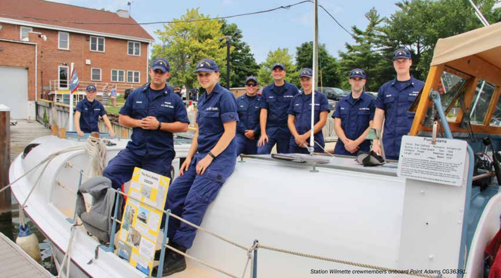
Station Wilmette crewmembers onboard Point Adams CG36391.